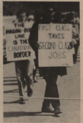
EQUALITY MARCHERS — Anti-Goldwater pickets parade in front of the Cow Palace during the convention. Some of the college students involved carried signs similar to the above, and chanted "Bury Barry!" The strains of "We Shall Overcome" were often matched by Goldwater supporters shouting "Go-go-Goldwater!"