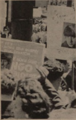
PRESIDENT RINGO — While Goldwater and Scranton demonstrators waved signs downtown, hundreds of teenagers converged on Union Square early in the week, screaming, "Ringo for President." The Beatle's fans bore signs like, "Twinkle, twinkle, Ringo Starr," and, "If it's ex-movie star Murphy for Senator, why not Ringo for President?"