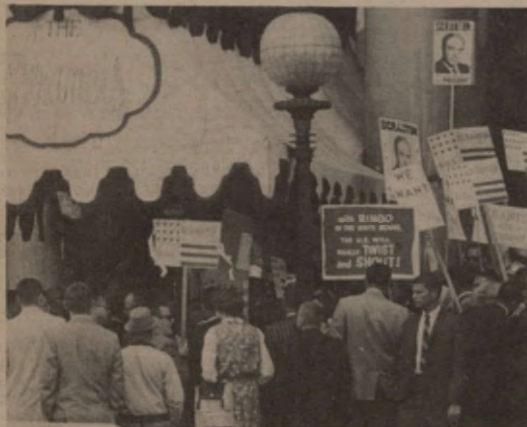
THE LAST HURRAH — A mob of Scranton demonstrators gathers in front of the St. Francis Hotel, demanding that the Pennsylvania governor come out. They later charged into the hotel, chanting "Bill will win!" but the action did not bring out Scranton.

Outside, Sir Percy moped softly and held his position.